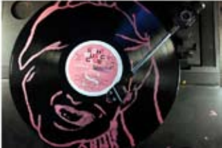
Video Stills 2007