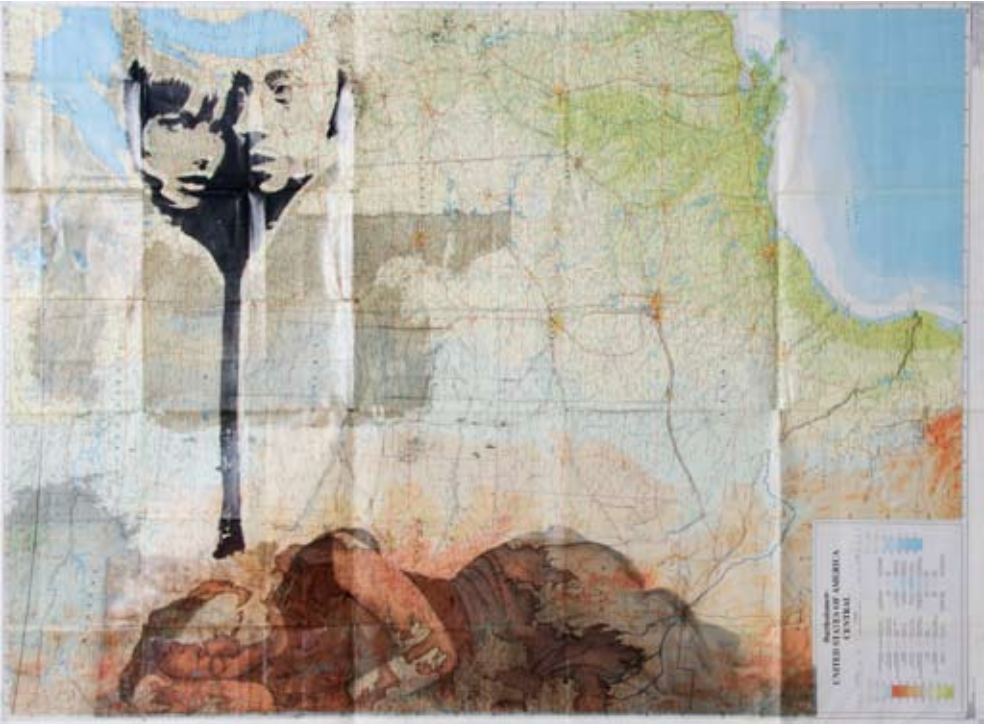
American Dream 2008