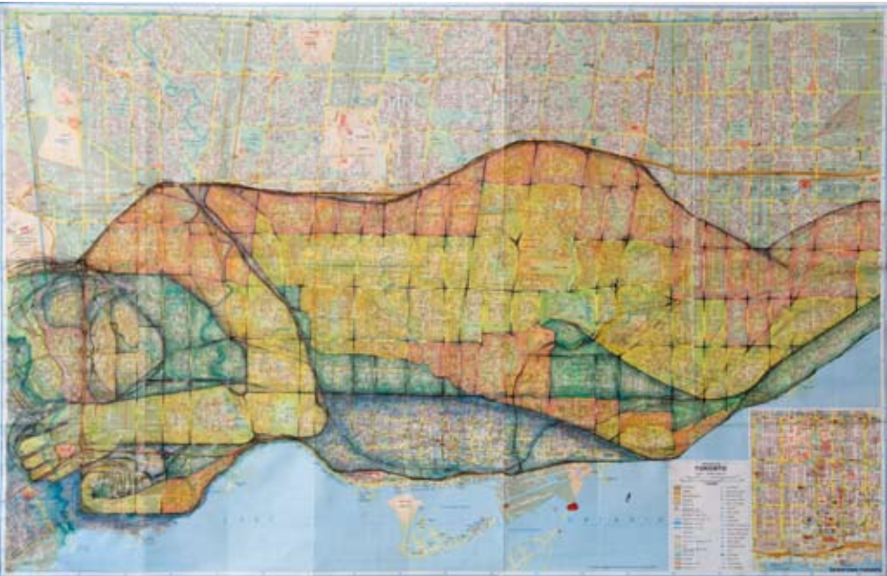
Sleeping City 2008